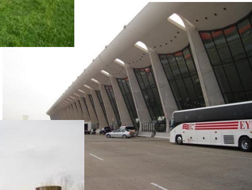
Dulles International Airport