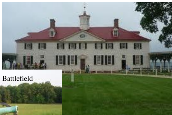
Manassas National Battlefield