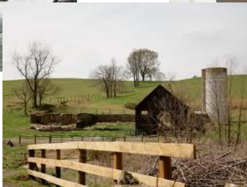
Aldie Dam Road, Loudoun