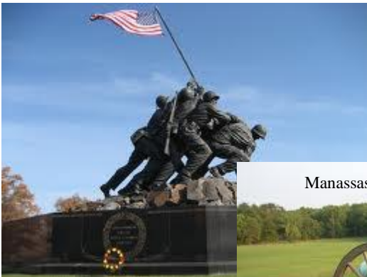
Iwo Jima Memorial, Arlington