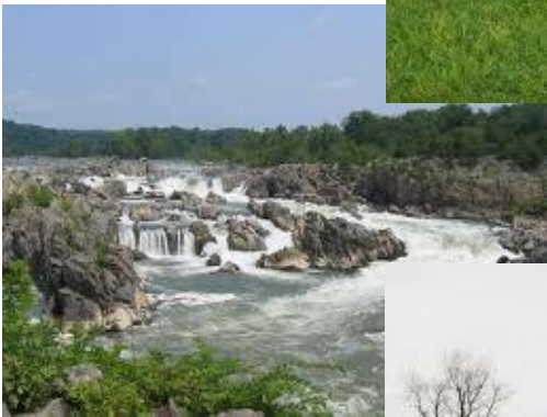
Great Falls, Fairfax